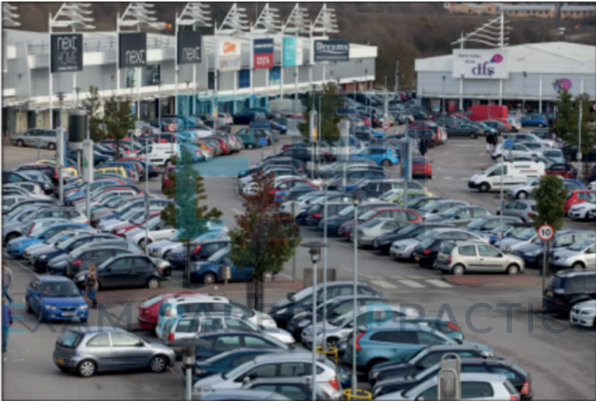
Fig 1 – Retail Park

With reference to the photograph, suggest why many new shopping centers locate out of town