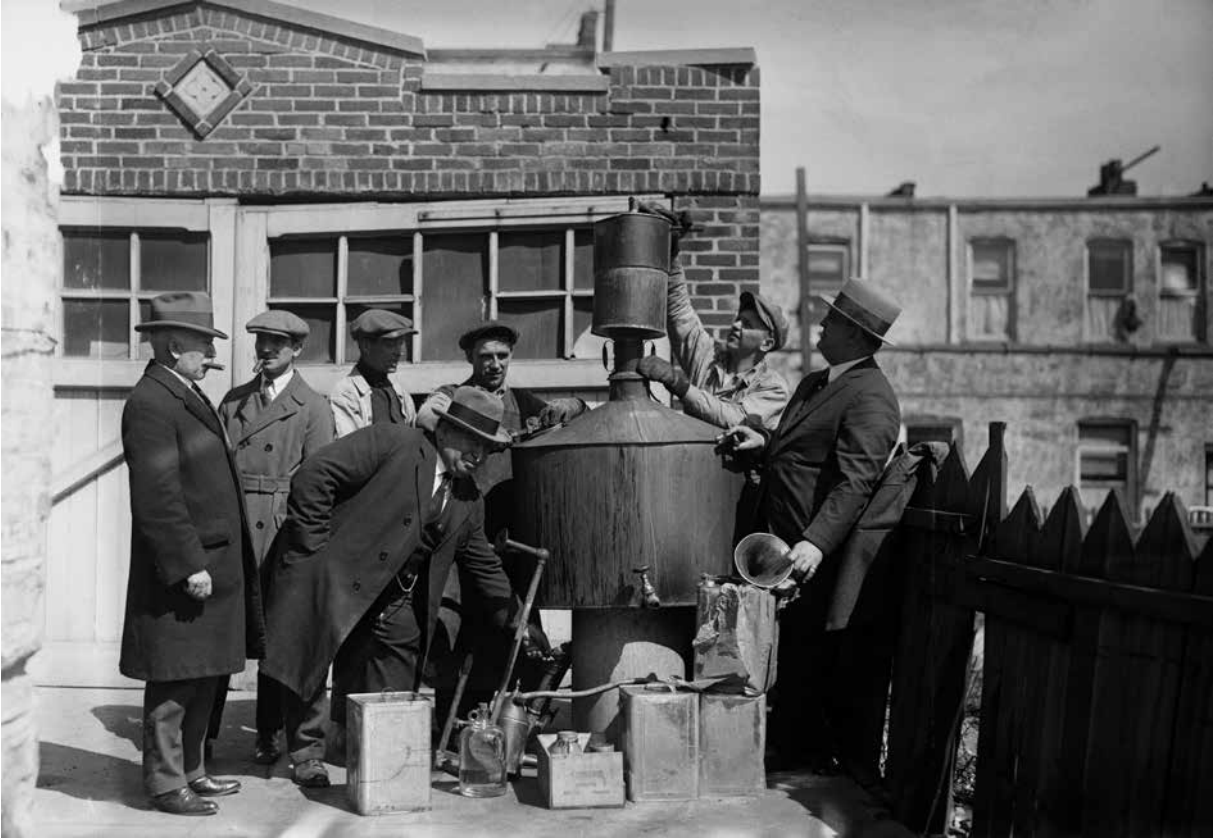
A photograph of Izzy and Moe and other Prohibition Agents, published after a raid in 1925.