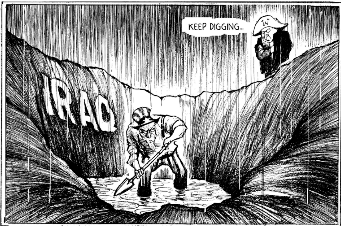
The Plan for Victory

A cartoon published in the USA in November 2005. The man in the hole is Uncle Sam, who represents the USA. The man shouting instructions is President George W. Bush.