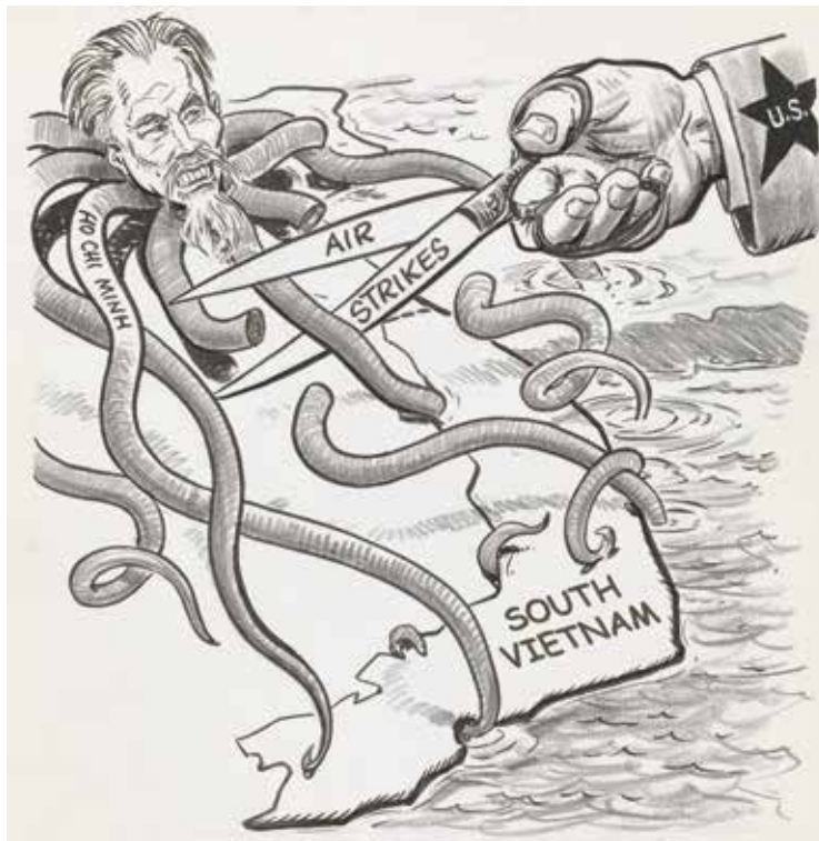
A cartoon published in the USA in April 1965.