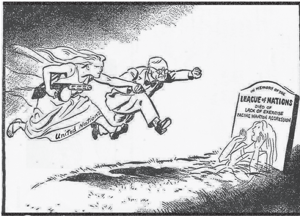
HISTORY DOESN'T REPEAT ITSELF

A cartoon published in Britain, 30 June 1950. The man holding the hand of the United Nations is President Truman.