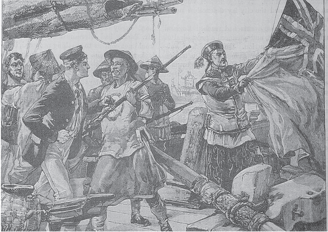
An illustration of events on the Arrow published in a British magazine in October 1856.