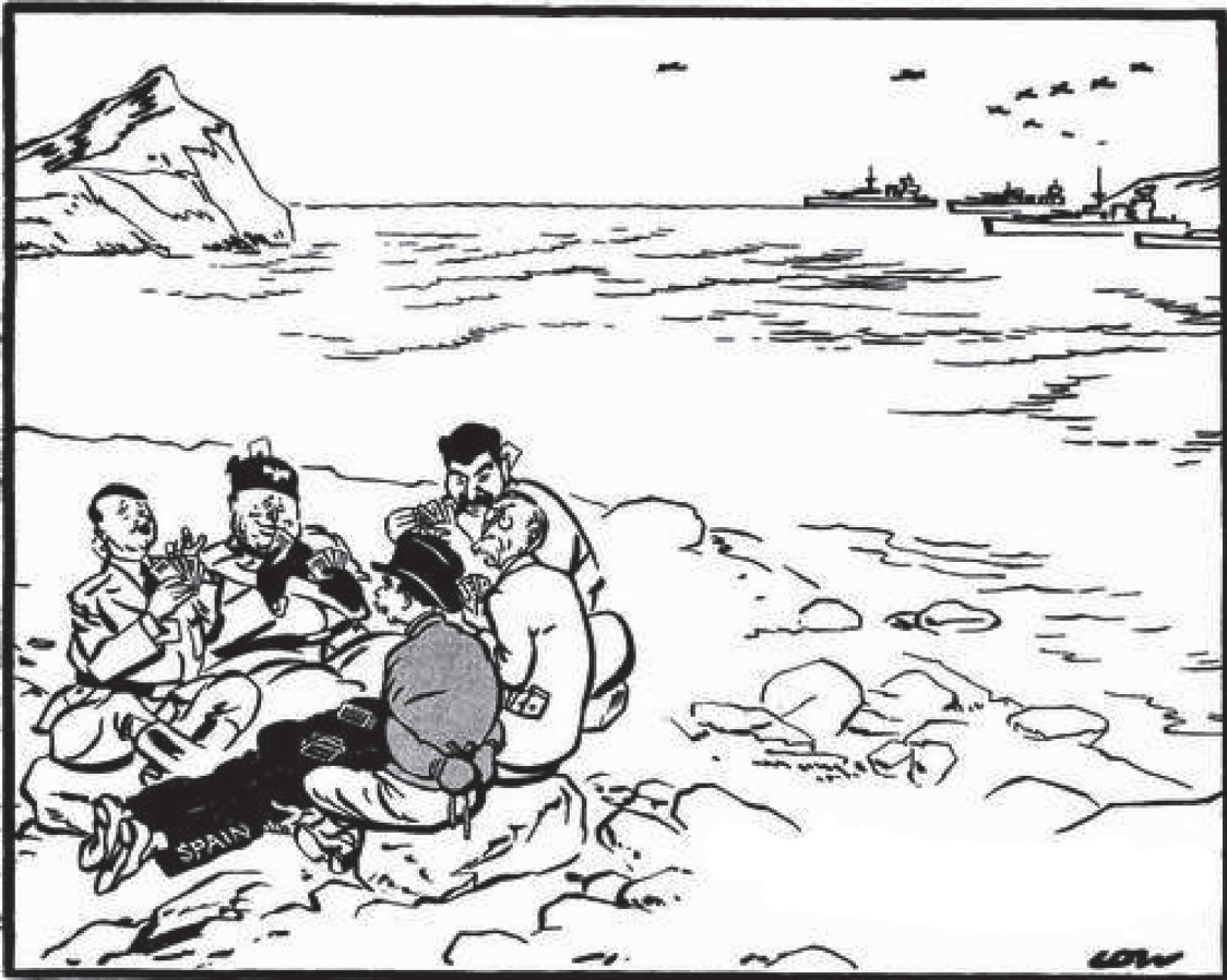
A British cartoon published in January 1937. On the left are Hitler, Mussolini, Stalin, Blum and Eden (a leading member of the British government) playing cards. 'Trustful Tony' (Eden) is saying, 'Just to discourage cheating, I'll wear a strait-jacket and let you chaps play my cards.' In the top left is the rock of Gibraltar.